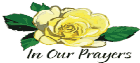
In Our Prayers